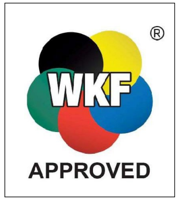
Design is attached in annex 1 of this contract.

2.- WKF logo and the word to be printed will be as it is shown next: